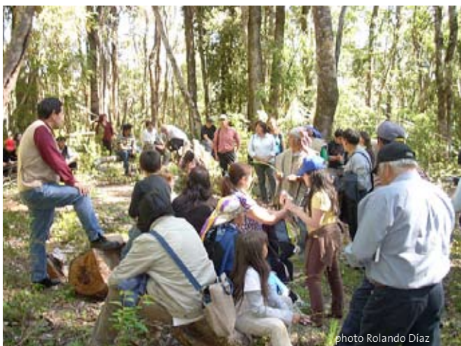
'Forests Day' meeting, and environmental education activity in the forest, from the perspective of the Mapuche culture, "lof epurewe" community, municipality of Loncoche, Southern Chile

These seemingly arcane battles over linguistic nuances reflect very real REDD-related disputes now unfolding on the ground. In most cases examined in this report, Indigenous People and others are struggling to engage in consultations and other relevant processes, even though their involvement in REDD, and the potential gains to be had from it, have been widely promoted. Respect for and compliance with Indigenous Peoples' rights also seems to be a missing element in many cases. There is also an over-riding concern about impacts on Indigenous Peoples' societies and cultures in general.