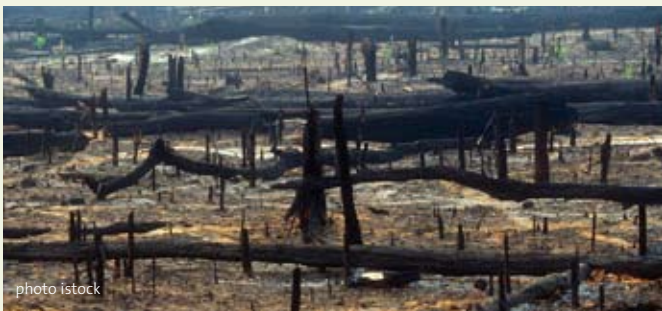
Deforestation, Brazil: 60-70% of deforestation in the Amazon is caused by cattle ranching and soya cultivation.