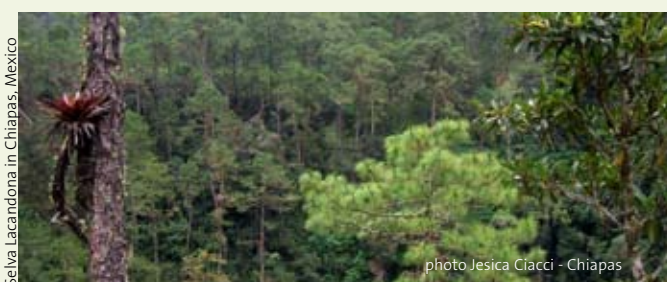
Selva Lacandona in Chiapas, Mexico