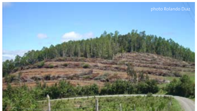
Clear cut logging of native forest, Mawuidanche mountain range, municipality of Loncoche, Southern Chile