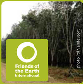
Rubber trees on a rubber plantation. Many rubber plantations are being taken over for palm oil. Indonesia; Sumatra 2004