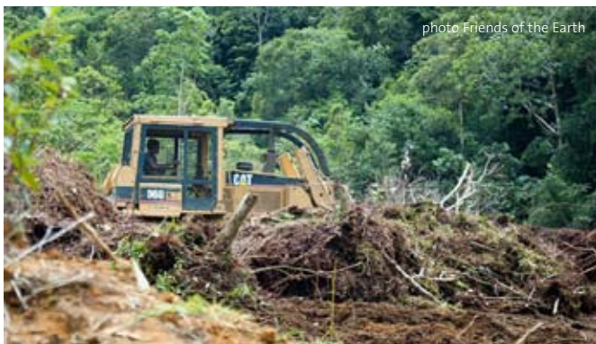
Digger clears rainforest in order to make way for a palm oil plantation, Indonesia

The Partnership’s founding document also makes no mention of Indigenous Peoples’ rights (although it does refer to their engagement in REDD-related processes). Concerns about this omission have been met with evasive responses (Martone, 2010).