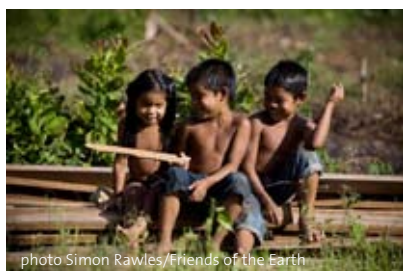
Children from the Makushi tribe playing, Iwokrama Forest, Guyana

The United Nations Collaborative Programme on REDD (UN-REDD) also aims to help countries to prepare for REDD. Its project objectives include quantifying carbon stored in forests, and property and forest tenure issues.