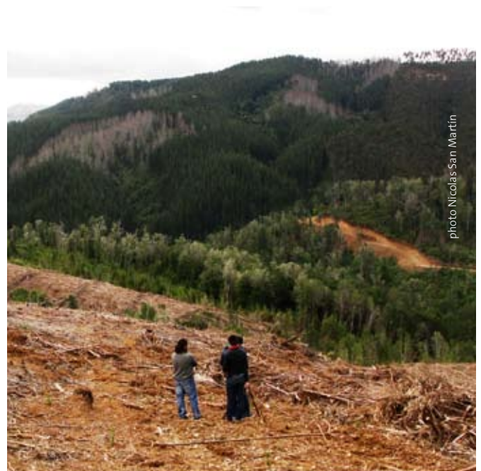
Foreground: Clear cut logging of eucalyptus plantation. Background: Pine tree and eucalyptus plantations, and 'extraction' roads opened in native forest. Mawuidanche mountain range, municipality of Loncoche, Southern Chile