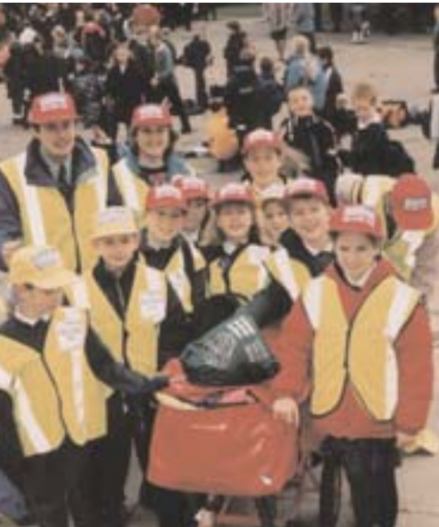
East Kent Gazette