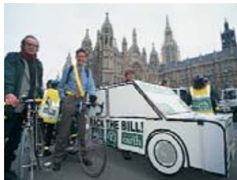
... in various guises ...