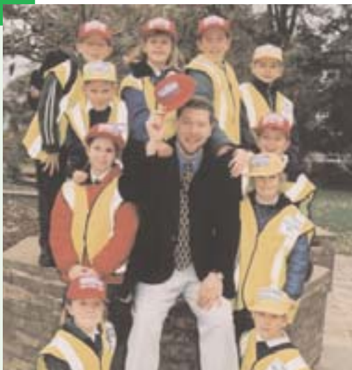
East Kent Gazette

“If you are willing to put in some time at the beginning and a little effort on an ongoing basis, a walking bus is a very easy thing to set up. People are generally dissatisfied with the current ways of getting to school and are willing to back you up if you want to change things. And if some children are converted to walking for the rest of their lives, think what an impact that would have on their health and the whole environment.”