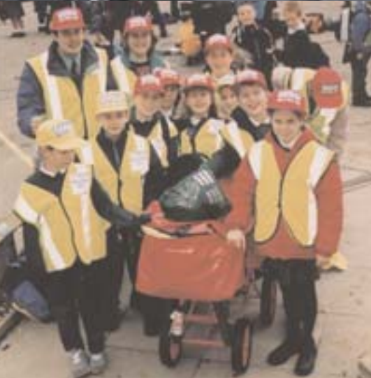
East Kent Gazette