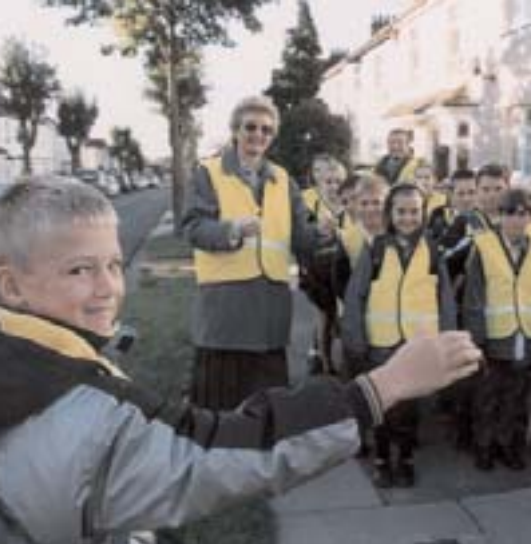
Yellow Advertiser Newsgroup