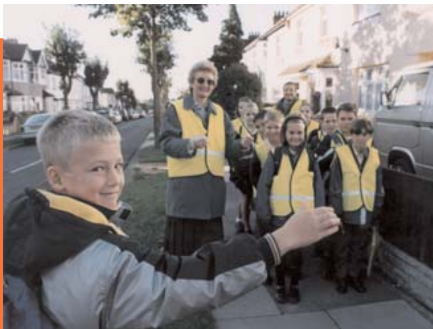
Yellow Advertiser Newsgroup

The majority of walking bus schemes have been established by local authorities but anyone can set up a walking bus. Local Friends of the Earth groups, individual parents/head teachers, and the local media have all set up schemes which vary in size and cost from virtually nothing to £60,000. Below are three examples of such schemes set up by three very different organisations. (For information about other walking bus schemes contact the Pedestrians Association – contact details can be found on page 13.)