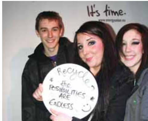
Brighton students make an intelligent energy suggestion at the Tour's club night.

The tour finished in Brighton with a sell-out gig. Read more at http://bhfoe.org/2011/02/24/our-city-our-future/