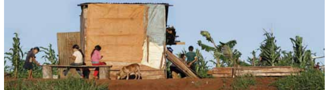
Temporary roadside shacks are now home for Paraguayans displaced from their land by soy production.

Want to find out more? Join the Food Network. Sign up at http://uk.groups.yahoo.com/group/food_net/ or email louise.rigby@foe.co.uk