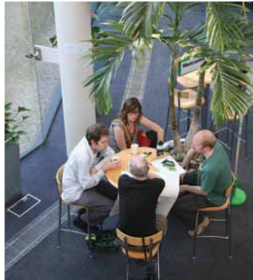
A small-group Conference session taking place at Nottingham's light-filled atrium in 2009.

While Friends of the Earth staff prepare for Conference months in advance, it's the people that attend who make it successful. If your group wants to run a session, bring a creative stall for our green fair, or propose a seminar, please mention it on the booking form. Please make sure you book before 15 August . Places are limited so look out for the booking form coming your way very shortly.