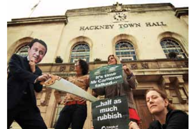
The Hackney & Tower Hamlets local group show passers-by that David Cameron needs to slash waste

Eric Pickles MP won our Talking Rubbish Awards for spreading myths about recycling. We held a spoof award ceremony outside Parliament, and handed in more than 5,000 postcards asking the Government to work with