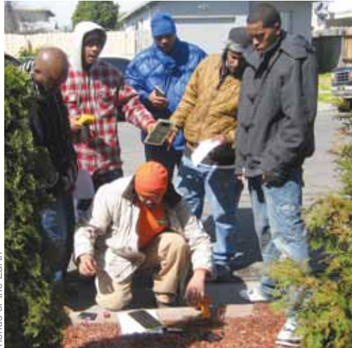
Training solar electricians is one way new green jobs are being created in San Francisco.

All of these groups also came together last year to fight off an attack on the State's Climate Law by Texan oil companies. With renewables under threat in the UK, we must follow this example. Sign up to get involved in the Big Energy Conversation now (see p4).