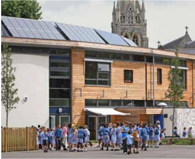
Just like this London primary school's energy roof, many buildings have the potential to generate their own renewable energy.

We're asking you to start gathering evidence of the impact of the Government's indecision on its commitment to renewable energy. You'll also have an opportunity to assess the local potential for renewable energy generation (see back page for top tips on identifying allies). Together we can use this research to show just