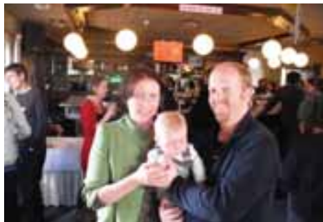
Friends of the Earth