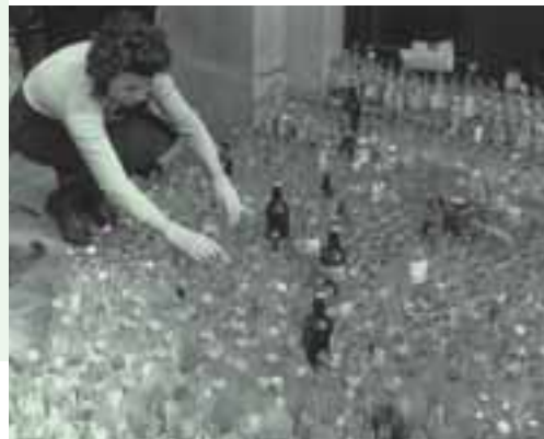
Friends of the Earth's first campaign action, promoting reuse of Schweppes bottles in 1971