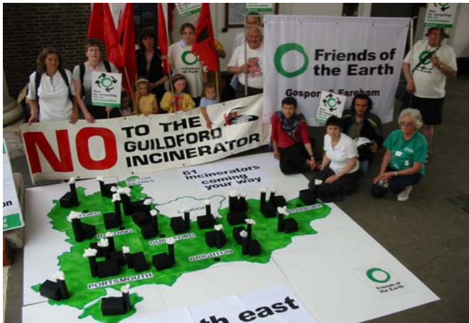
Angry: Campaigners protest in Guildford against the Regional Assembly's plans to build up to 61 incinerators in the South East.

Campaigners wasted no time in getting their voice heard on incineration this summer.