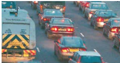
What might have been

The South East of England Regional Assembly responded angrily to the news. Its Planning Committee tabled a resolution to the full meeting saying it was “appalled by the Secretary of State’s decision on the South Coast Continued on page 4